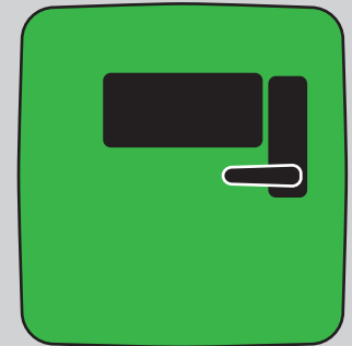
Defib Store 4000 Ile