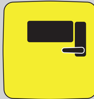
Defib Store 4000 Ile

Battery powered, motion sensor LED light to illuminate cabinet on opening. Easily detachable for use as a torch in a rescue.